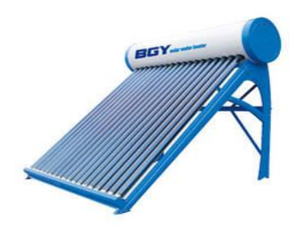
Fig.7. Solar water heater

A solar water heater is a device that uses heat energy of the sun to provide hot water for various applications. In homes, it is useful for bathing, washing, cleaning, and other chores.