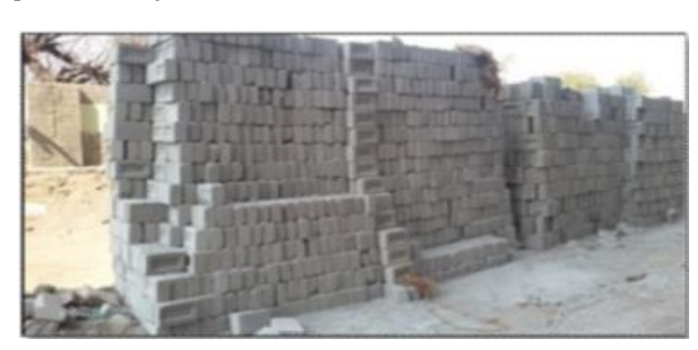
Fig.1. Sand lime bricks

1.6.1. Sand Lime Bricks: The main constituents of sand lime bricks are sand, lime, fly ash, water. Using sand we can achieve the adhesiveness to hold the particles together. Its brittleness helps us to recycled it and reuse in other works.