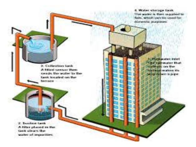
Fig.5. rainwater harvesting

Rainwater harvesting system we are collect rainwater from roof and then storing it is storing it in a tank. The collected water can then be used for other purposes such as toilet and sprinkler system. The rain barrels are one of the most common methods of Rainwater harvesting is being frequently used this day