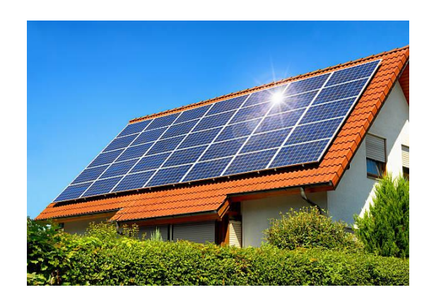
Fig.6. Solar Panel

Solar energy is clean and renewable source energy. Solar panels are an emerging and hot technology for peoples who want to utilize the natural power all around us. Solar power brings down the energy consumption and supply excess energy to your utility company