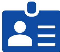
DOL and FSLA Rules – Co-employment, overtime, hiring/firing workers