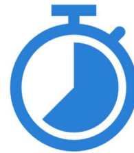
Managing, scheduling, authorizing timesheets, documentation, Medicaid qualifications

The decision to direct services must come from the individual. Once the individual decides to self-direct services, the SD Agreement is discussed and signed by all parties.